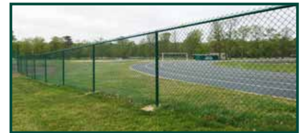
Green security fencing erected around outdoor play areas