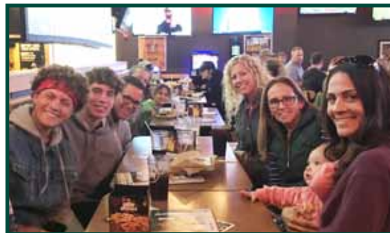
Dining out for Spirit Days at Buffalo Wild Wings in Mays Landing helped raise funds for our athletic teams and programs.