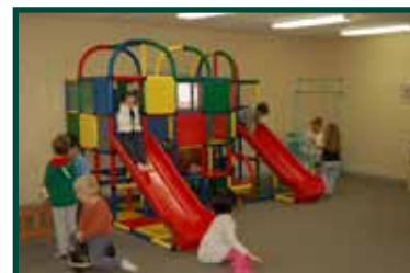
New indoor and outdoor Early Education playgrounds