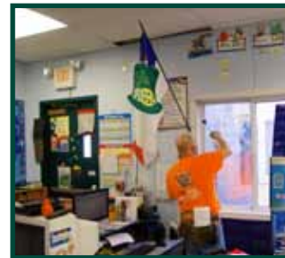
Security ballistic film installed on first floor classrooms and office windows, funded by a School Shield Program grant from the NRA Foundation.