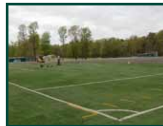
New artificial turf Varsity Soccer field