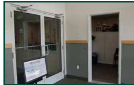
New school office entrance with locking front doors

Individuals, churches, organizations, and foundations blessed ACS with over $165,000 in donations and grants that enabled significant facility enhancements and security upgrades.