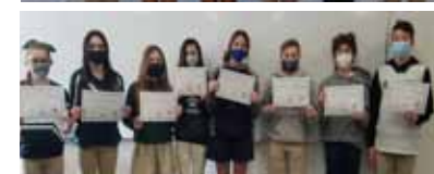
Original stories and poems written by 8th grade students were selected in contests for publication by Young Writers USA.