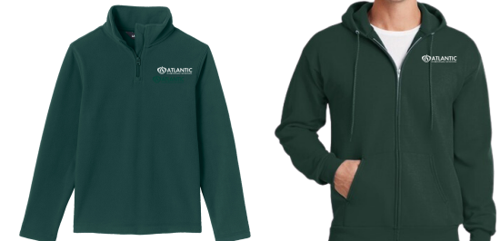
SWEATSHIRT 1/4 OR FULL ZIP: HUNTER GREEN WITH ACS LOGO