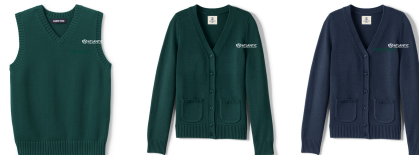
HUNTER GREEN OR NAVY BUTTON FRONT CARDIGAN WITH ACS LOGO OR PULLOVER V-NECK VEST WITH ACS LOGO.