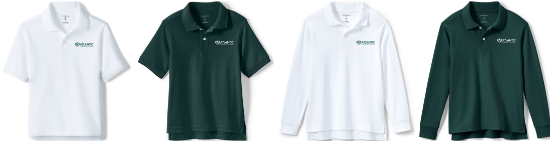
SHORT OR LONG SLEEVE WITH ACS LOGO | SOLID WHITE OR HUNTER GREEN