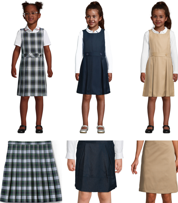
COLORS: PLAID*, NAVY OR KHAKI