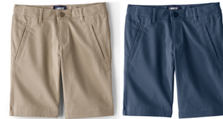
SOLID NAVY OR KHAKI BERMUDA SHORTS

ELEMENTARY STUDENTS ARE NOT PERMITTED TO WEAR SHORTS FROM DECEMBER TO FEBRUARY