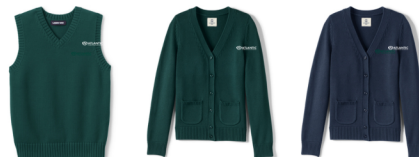
HUNTER GREEN OR NAVY BUTTON FRONT CARDIGAN WITH ACS LOGO OR PULLOVER V-NECK VEST WITH ACS LOGO.