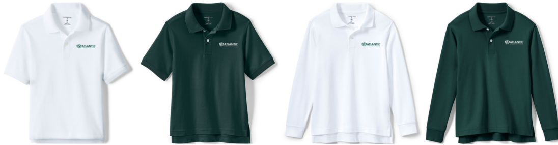
SHORT OR LONG SLEEVE WITH ACS LOGO | SOLID WHITE OR HUNTER GREEN