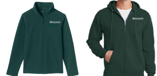
SWEATSHIRT 1/4 OR FULL ZIP: HUNTER GREEN WITH ACS LOGO