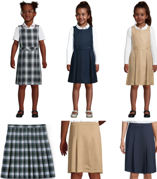
COLORS: PLAID*, NAVY OR KHAKI