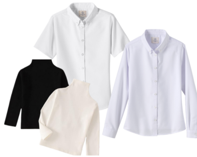
THESE SHIRTS CAN BE WORN UNDER THE JUMPER, FLEECE, OR SWEATER ONLY: