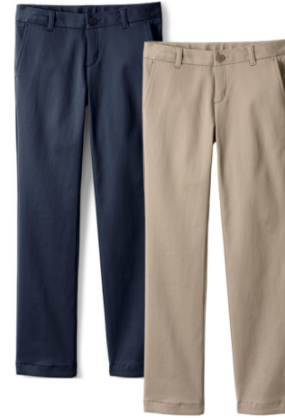
SOLID NAVY OR KHAKI